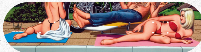
DM - POOLSIDE 1 SKATEBOARD