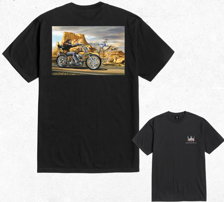
DM - GHOST RIDER