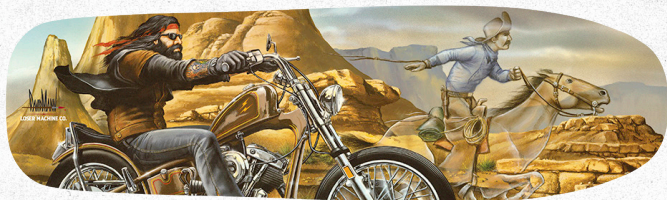
DM - GHOSTRIDER - SKATEBOARD