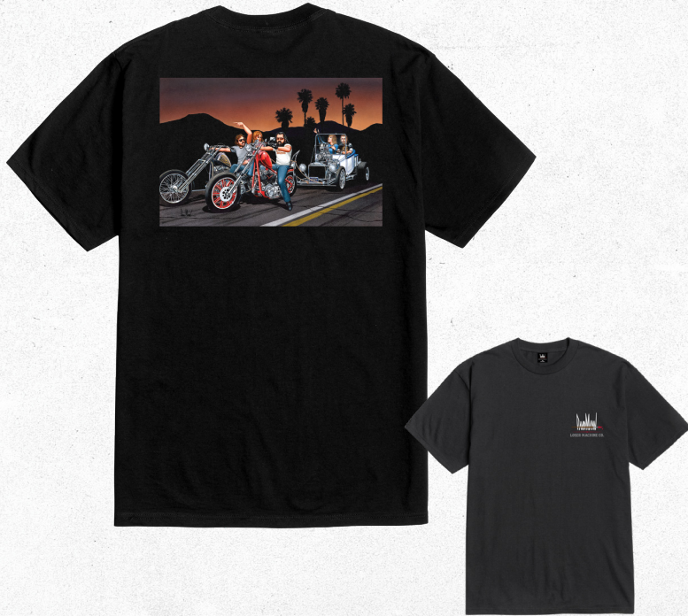
DM - HOT ROD HELP