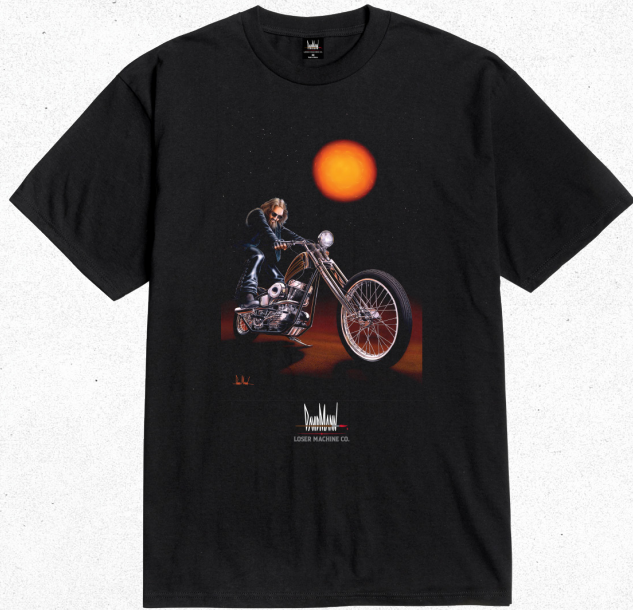
DM - KICK-START