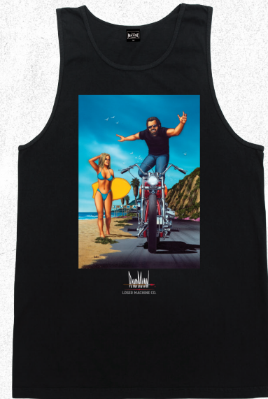
DM - SHOWIN' OFF