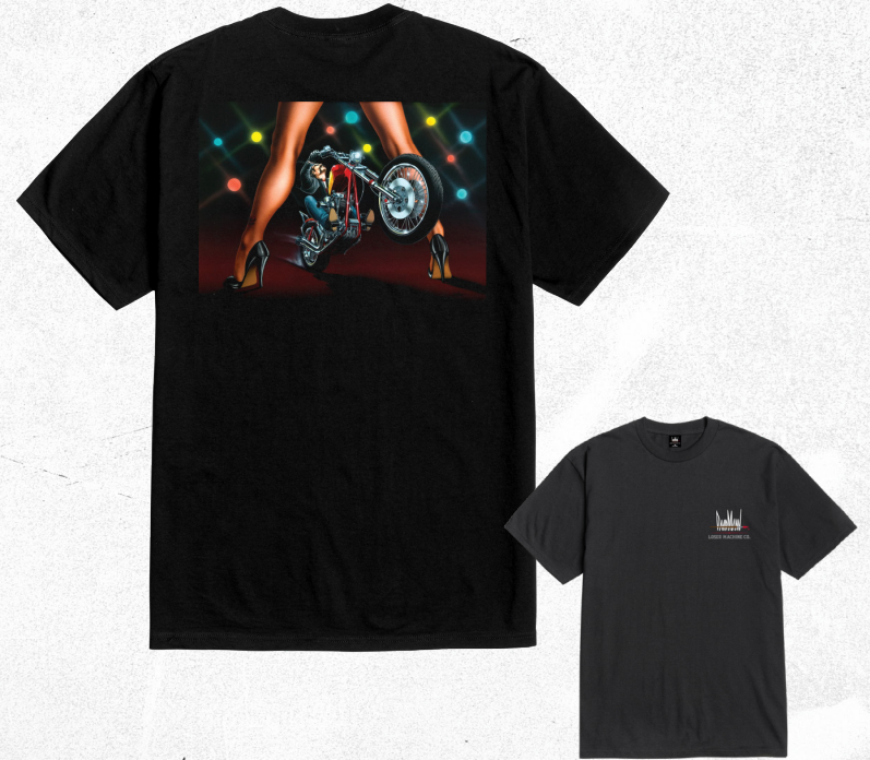
DM - LEGS