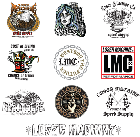
LMC STICKER PACK X