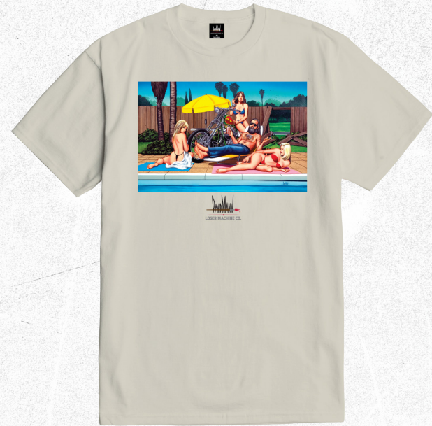
DM - POOLSIDE