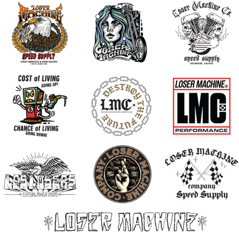
LMC STICKER PACK X