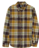
BROWN / BRONZE