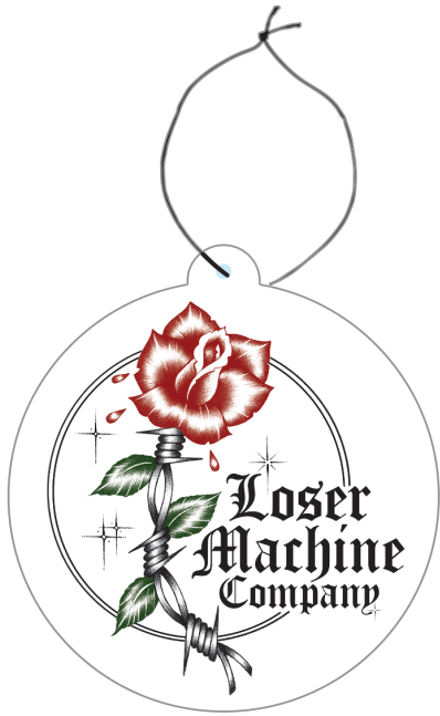
ROSE GARDEN AIR FRESHENER