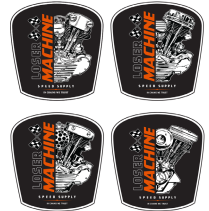
MOTOR STICKER PACK