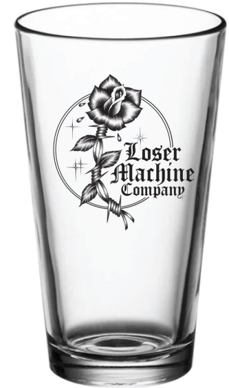
ROSE GARDEN BIG HOUSE PINT GLASS