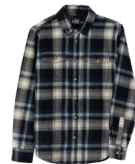
BLACK / NAVY