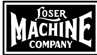
NEW OG LARGE