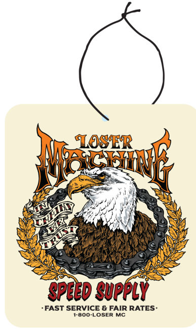
SPEED SUPPLY AIR FRESHENER