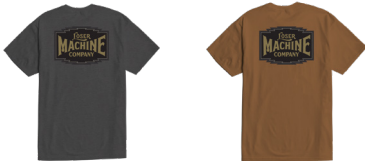
HEATHER CHARCOAL BROWN SUGAR