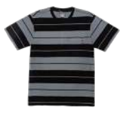
CHARCOAL / BLACK