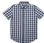
INDIGO / WHITE