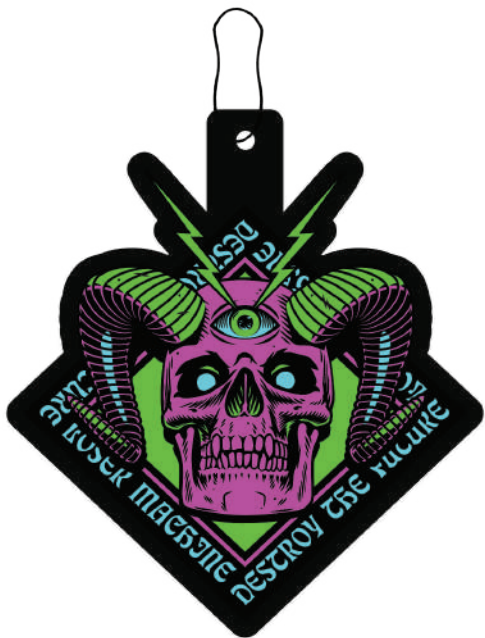
EYE OF INSIGHT AIR FRESHENER