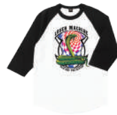
WHITE / BLACK