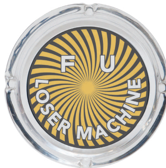
FU SWIRL ASH TRAY