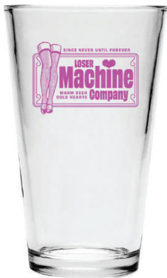
COLD HEARTS PINT GLASS