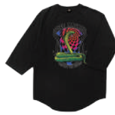
BLACK / BLACK