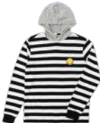
BLACK / WHITE