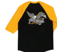
BLACK / GOLD