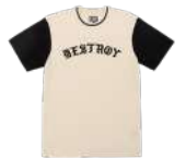
ANTIQUE / BLACK