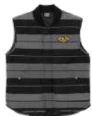
CHARCOAL / BLACK