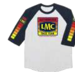
HEATHER GREY / NAVY