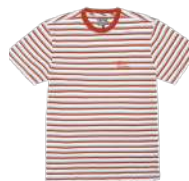
RUST / WHITE