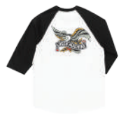
WHITE / BLACK