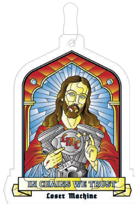
MAJESTIC AIR FRESHENER