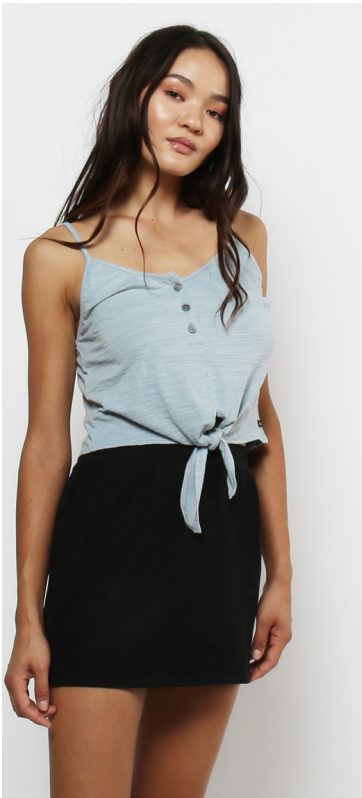
JC3510 HAILEY SKIRT

BLACK | BLUE XS - L | 75% POLYESTER 25% COTTON USA: w/s $22 msrp $44 CAN: w/s $25 msrp $50