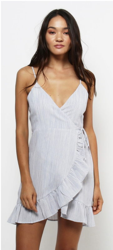
JC3533 CLEMENTINE DRESS

BLUE | BLACK XS - L | 60% COTTON 30% POLYESTER 10% VISCOSE USA: w/s $26 msrp $52 CAN: w/s $30 msrp $60