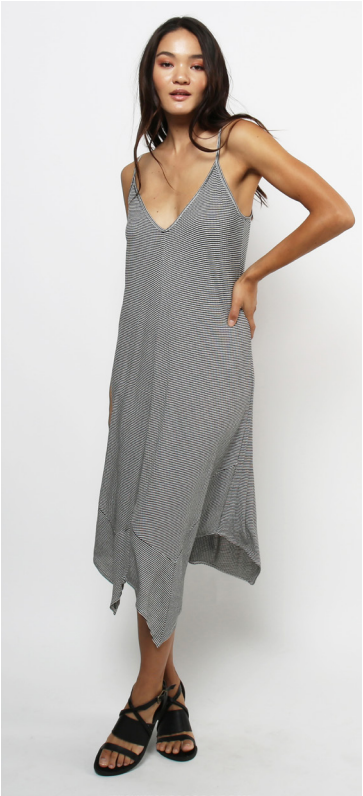
JC3524 JADE DRESS

FOUR WAY STRETCH SNIM CATALOG EXTENDED LENGTH MADE IN THE USA CARRY OVER