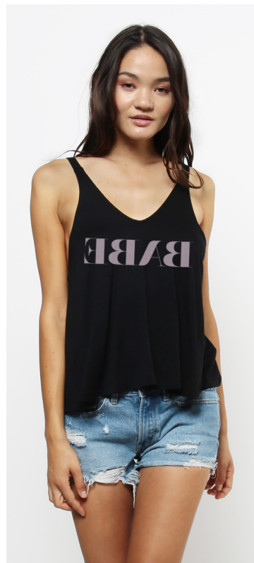
JD3543 BABE TANK

BLACK | WINE XS - L | 96% RAYON 4% SPANDEX USA: w/s $14 msrp $28