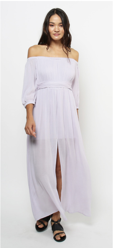
JC3523 KYLIE DRESS

LILAC | BLUE XS - L | 100% VISCOSE USA: w/s $32 msrp $64 CAN: w/s $37.50 msrp $75