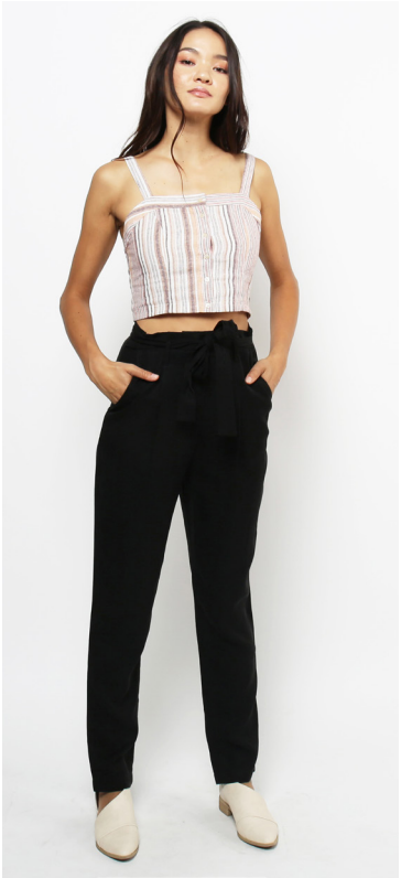
JC3520 RITA PANT

BLACK | BROWN XS - L | 100% TENCEL INSEAM: 29.5" RISE: 12.5" USA: w/s $30 msrp $60 CAN: w/s $35 msrp $70