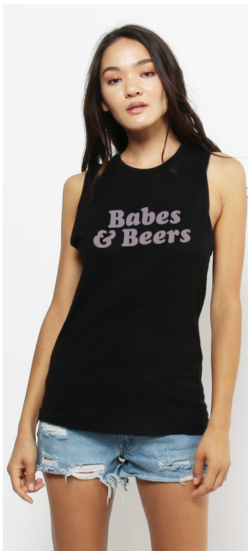
JD3470 BABES AND BEERS TANK

BLACK/LILAC | IVORY XS - L | 100% COTTON USA: w/s $14 msrp $28