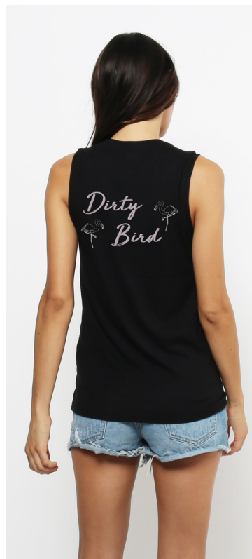
JD3546 DIRTY BIRD TANK

BLACK | SKY XS - L | 100% COTTON USA: w/s $14 msrp $28