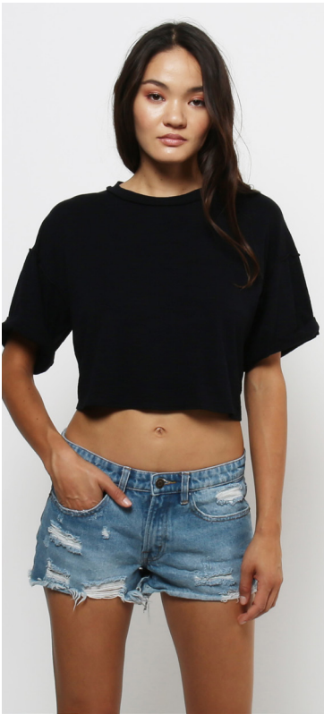
JC3500 AVA TOP

FOUR WAY STRETCH SNIM CATALOG EXTENDED LENGTH MADE IN THE USA CARRY OVER