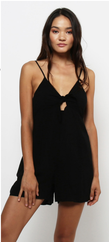
JC3537 LACY ROMPER

BLACK | IVORY XS - L | 100% VISCOSE USA: w/s $24 msrp $48 CAN: w/s $27.50 msrp $55