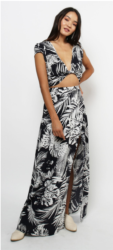
JC3530 ATHENA TOP

FOUR WAY STRETCH SNIM CATALOG EXTENDED LENGTH MADE IN THE USA CARRY OVER