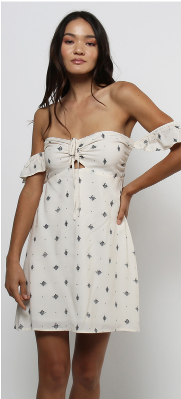
JC3506 LEAH DRESS

IVORY | RED OCHRE XS - L | 100% VISCOSE USA: w/s $28 msrp $56 CAN: w/s $32.50 msrp $65