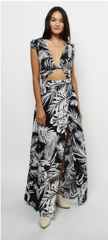
JC3531 MAGDALENA SKIRT

BLACK | CORAL XS - L | 100% VISCOSE USA: w/s $25 msrp $50 CAN: w/s $30 msrp $60