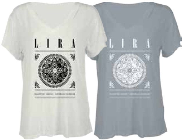
JD2743 MANDELLA S/S RAGLAN

IVORY | LT.BLUE XS - XL | 50% Modal 50% Cotton USA: w/s $15 msrp $30 CAN: w/s $20 msrp $40