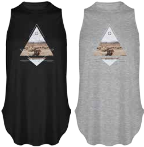
JD2737 SIERRA MUSCLE

BLACK | IVORY XS - XL | 50% Modal 50% Cotton USA: w/s $14 msrp $28 CAN: w/s $17 msrp $34