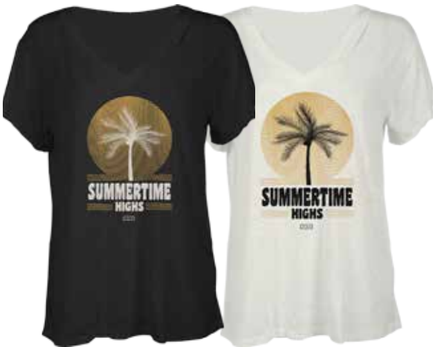
JD2740 SUMMERTIME HIGHS S/S V-NECK

BLACK | IVORY XS - XL | 96% Modal 4% Spandex USA: w/s $14 msrp $28 CAN: w/s $17 msrp $34