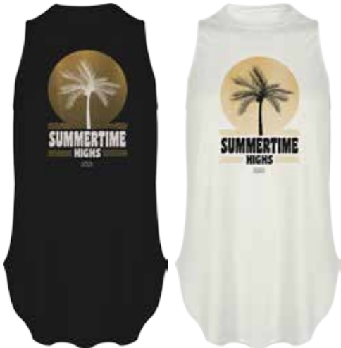
JD2741 SUMMERTIME HIGHS MUSCLE

CHARCOAL | IVORY XS - XL | 50% Modal 50% Cotton USA: w/s $15 msrp $30 CAN: w/s $20 msrp $40