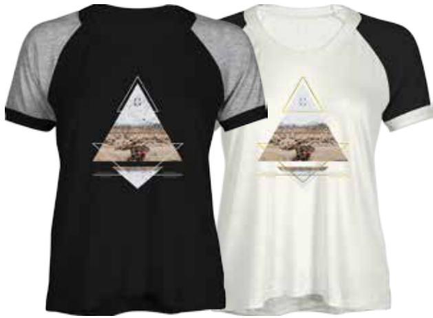
JD2735 SIERRA S/S RAGLAN

BLACK | IVORY XS - XL | 50% Modal 50% Cotton USA: w/s $15 msrp $30 CAN: w/s $20 msrp $40