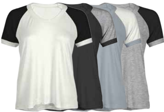
JD2664 SOLID S/S RAGLAN

IVORY | BLACK | LT.BLUE | H.GREY XS - XL | 50% Modal 50% Cotton USA: w/s $13 msrp $26 CAN: w/s $16 msrp $32