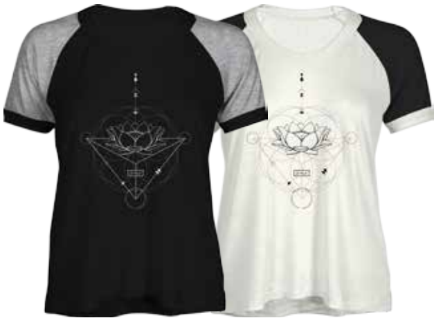
JD2747 SACRED S/S RAGLAN

BLACK | IVORY XS - XL | 50% Modal 50% Cotton USA: w/s $15 msrp $30 CAN: w/s $20 msrp $40