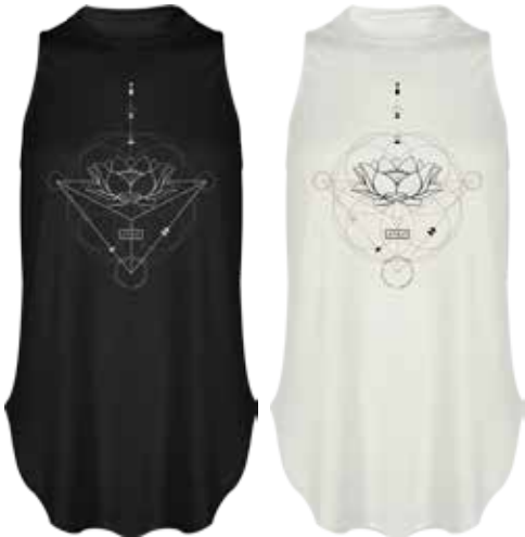
JC2749 SACRED MUSCLE

BLACK | IVORY XS - XL | 96% Modal 4% Spandex USA: w/s $14 msrp $28 CAN: w/s $17 msrp $34