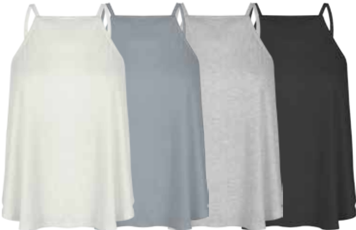
JD2752 SOLID HIGH NECK TANK

LT.BLUE | H.GREY | IVORY | BLACK XS - XL | 96% Modal 4% Spandex USA: w/s $12 msrp $24 CAN: w/s $15 msrp $30