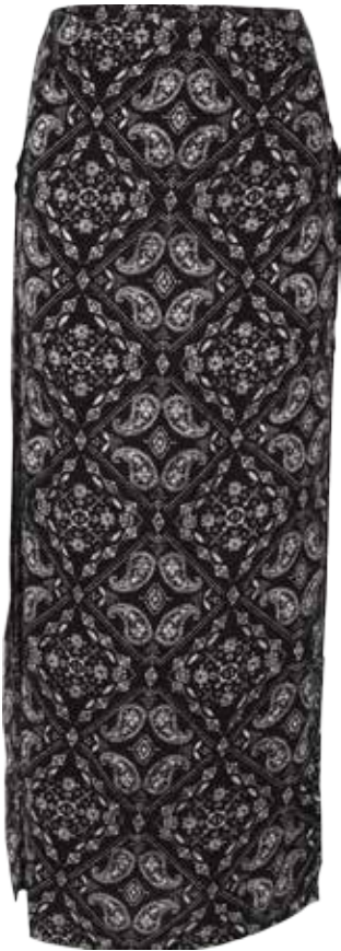
JC2717 CARA - SKIRT