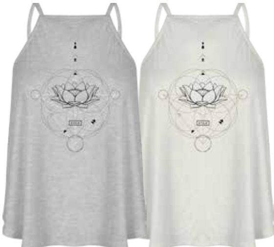
JD2750 SACRED TANK

H.GREY | IVORY XS - XL | 96% Modal 4% Spandex USA: w/s $14 msrp $28 CAN: w/s $17 msrp $34