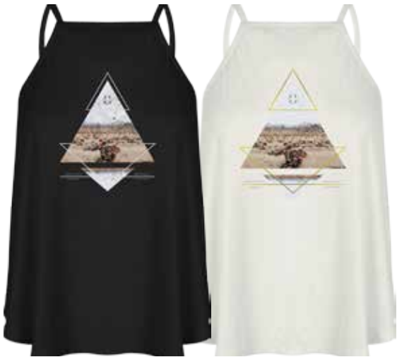
JD2738 SIERRA TANK

BLACK | H.GREY XS - XL | 96% Modal 4% Spandex USA: w/s $14 msrp $28 CAN: w/s $17 msrp $34