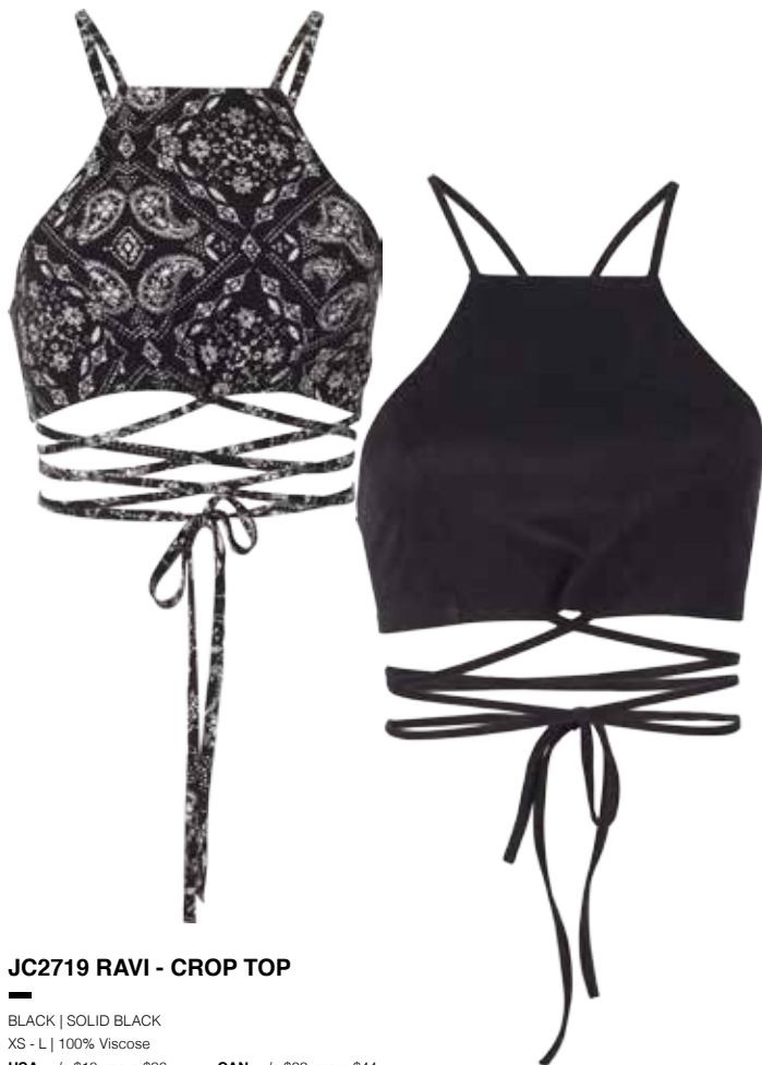
JC2719 RAVI - CROP TOP

BLACK | SOLID BLACK XS - L | 100% Viscose