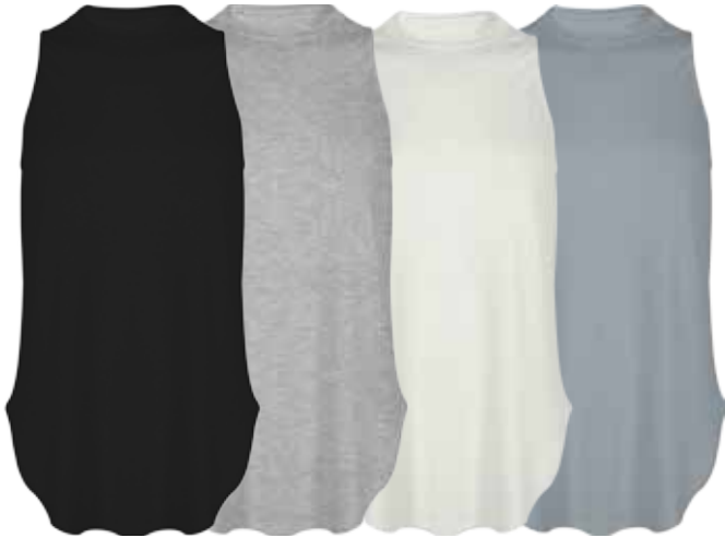
JD2666 SOLID MUSCLE

H.GREY | IVORY | LT.BLUE | BLACK XS - XL | 50% Modal 50% Cotton USA: w/s $12 msrp $24 CAN: w/s $15 msrp $30