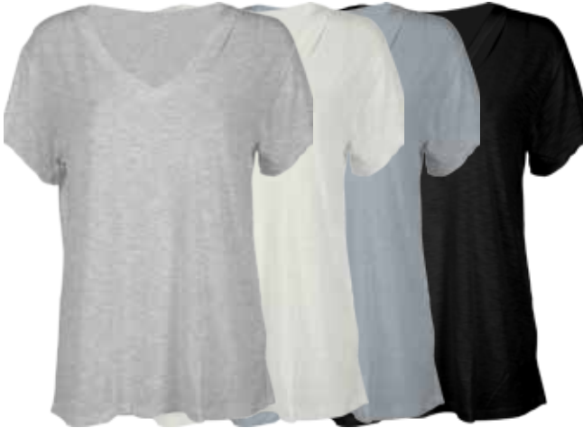
JD2751 SOLID S/S V-NECK

IVORY | BLACK | LT.BLUE | H.GREY XS - XL | 50% Modal 50% Cotton USA: w/s $13 msrp $26 CAN: w/s $16 msrp $32