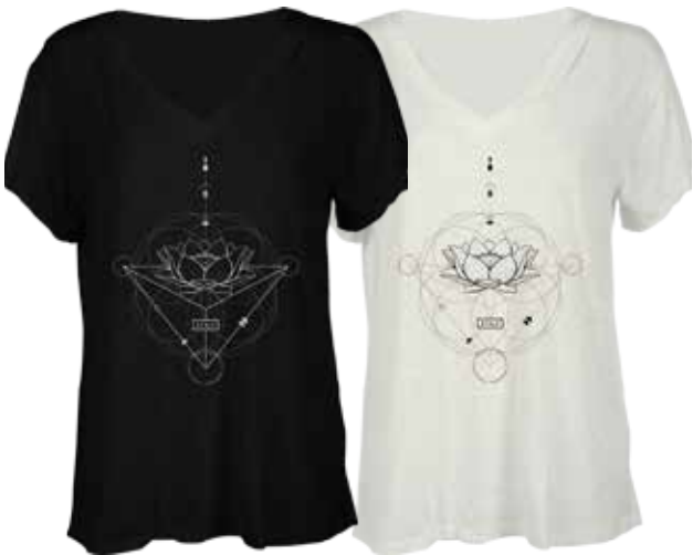
JD2748 SACRED S/S V-NECK

BLACK | IVORY XS - XL | 50% Modal 50% Cotton USA: w/s $14 msrp $28 CAN: w/s $17 msrp $34