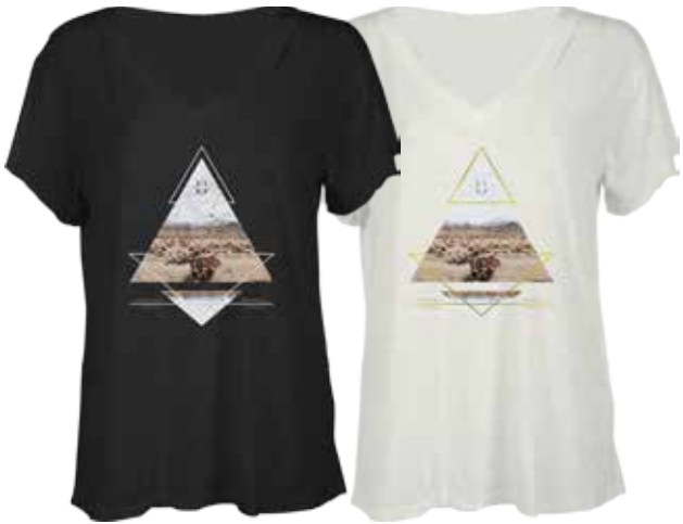
JD2736 SIERRA S/S V-NECK

BLACK | IVORY XS - XL | 50% Modal 50% Cotton USA: w/s $15 msrp $30 CAN: w/s $20 msrp $40