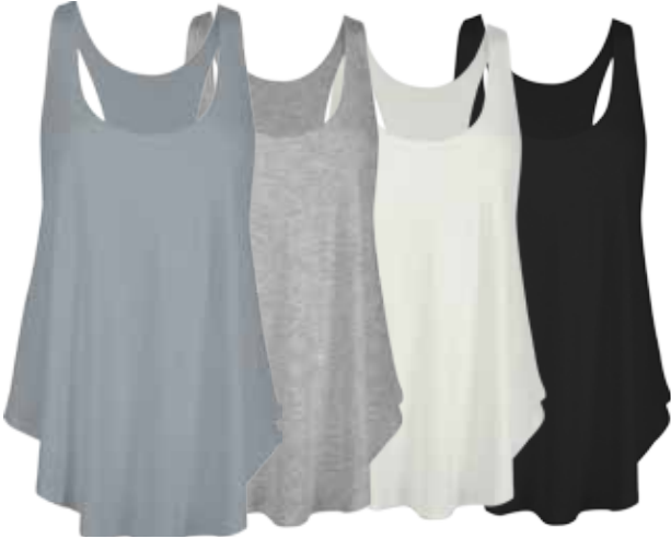
JD2667 SOLID RACERBACK TANK

BLACK | H.GREY | IVORY | LT.BLUE XS - XL | 96% Modal 4% Spandex USA: w/s $12 msrp $24 CAN: w/s $15 msrp $30