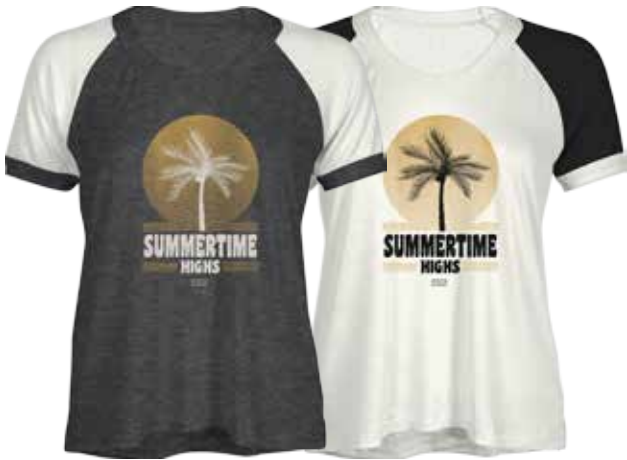
JD2739 SUMMERTIME HIGHS S/S RAGLAN

CHARCOAL | IVORY XS - XL | 50% Modal 50% Cotton USA: w/s $15 msrp $30 CAN: w/s $20 msrp $40