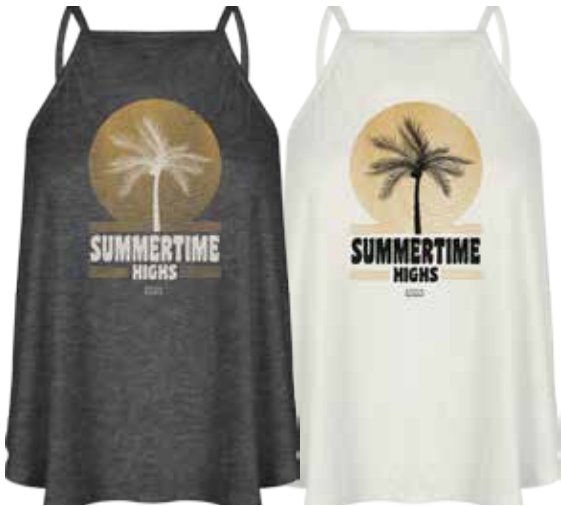
JD2742 SUMMERTIME HIGHS TANK

BLACK | IVORY XS - XL | 50% Modal 50% Cotton USA: w/s $14 msrp $28 CAN: w/s $17 msrp $34