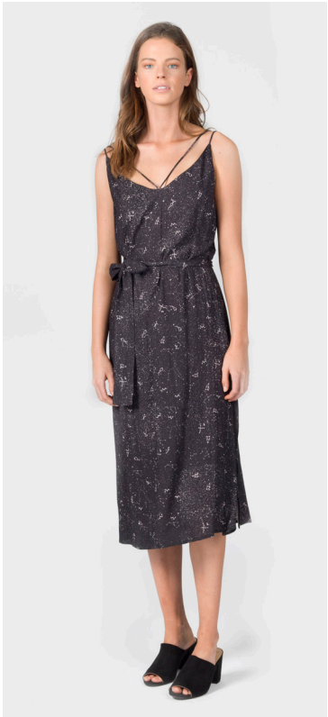
JC3248 STARRY NIGHTS DRESS

BLACK | IRON XS - L | 100% VSCOSE USA: w/s $26 msrp $52 CAN: w/s $32.50 msrp $65