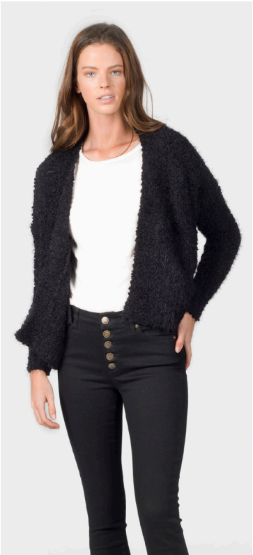
JC3328 SARAI SWEATER

BLACK XS/S, M/L | 65% POLYESTER 25% POLYAMIDE 10% ACRYLIC USA: w/s $32 msrp $64 CAN: w/s $42.50 msrp $85