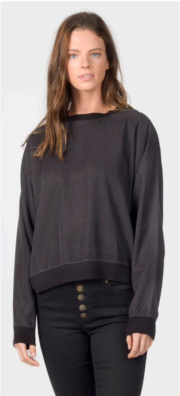
JC3306 MATLIDA CREW

BLACK | BURGUNDY XS - L | 100% TENCEL USA: w/s $27 msrp $54 CAN: w/s $35 msrp $70