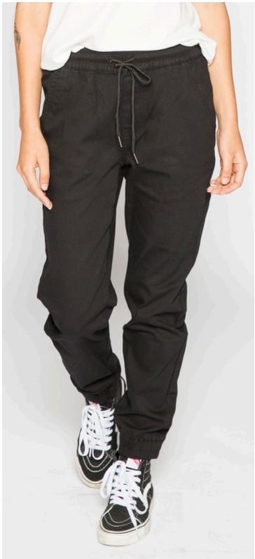
JC3215 IMPALA JOGGER

BLACK XS/S, M/L | 65% POLYESTER 25% POLYAMIDE 10% ACRYLIC USA: w/s $32 msrp $64 CAN: w/s $42.50 msrp $85