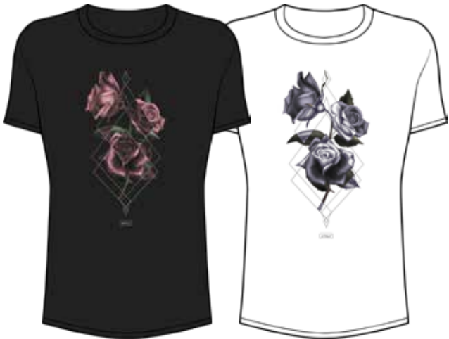
JD2947 STIPPLE ROSE - CREWNECK

BLACK | IVORY XS - L | 95% Modal 5% Spandex USA: w/s $14 msrp $28 CAN: w/s $16 msrp $32