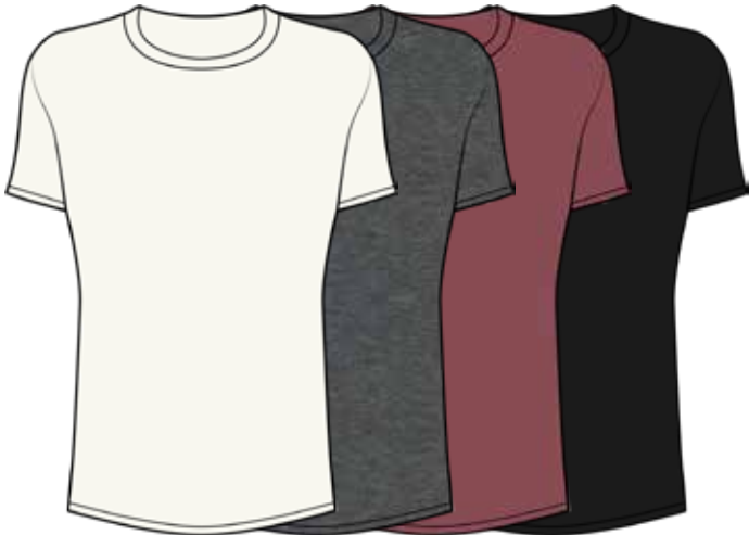
JD2868 SOLID CREWNECK

IVORY | CHARCOAL | BURGUNDY | BLACK XS - L | 95% Modal 5% Spandex