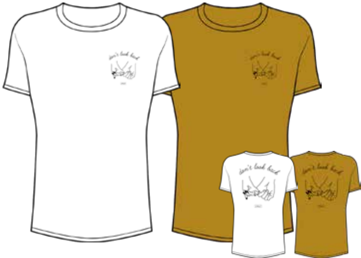
JD2944 DONT LOOK BACK - CREWNECK

IVORY | MUSTARD XS - L | 95% Modal 5% Spandex USA: w/s $14 msrp $28 CAN: w/s $16 msrp $32