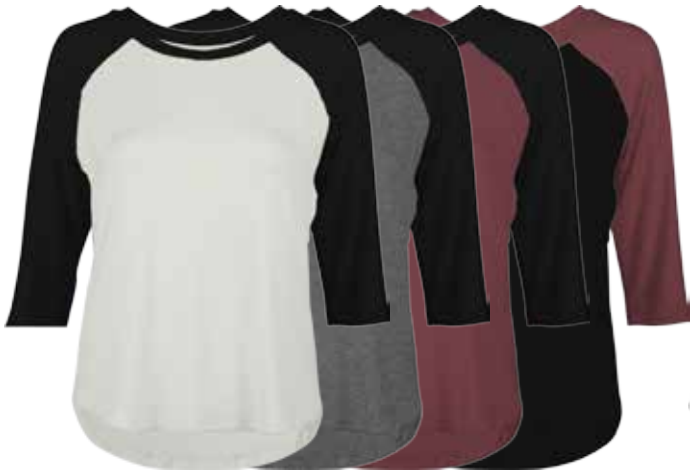
JD2866 SOLID RAGLAN

IVORY | CHARCOAL | BURGUNDY | BLACK XS - L | 50% Modal 50% Cotton