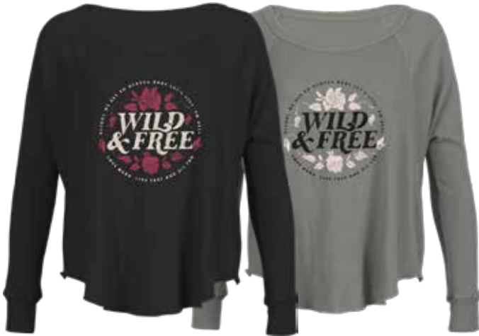
JD2936 WILD AND FREE - LONG SLEEVE

BLACK | SAGE XS - L | 95% Modal 5% Spandex USA: w/s $15 msrp $30 CAN: w/s $20 msrp $40