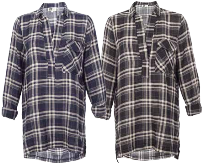
JC2910 VICTORY PLAID - DRESS

BLACK | IVORY XS - L | 55% Milk Fiber 39% Viscose 6% Spandex USA: w/s $22 msrp $44 CAN: w/s $25 msrp $50