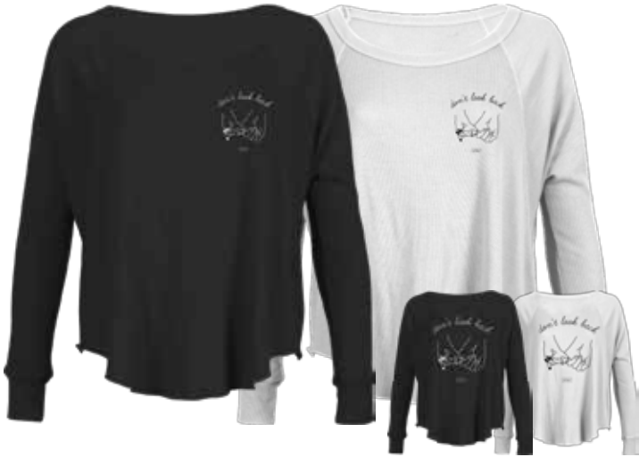
JD2942 DONT LOOK BACK - LONG SLEEVE