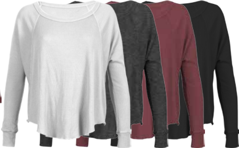
JD2951 SOLID LONG SLEEVE

IVORY | CHARCOAL | BURGUNDY | BLACK XS - L | 95% Modal 5% Spandex