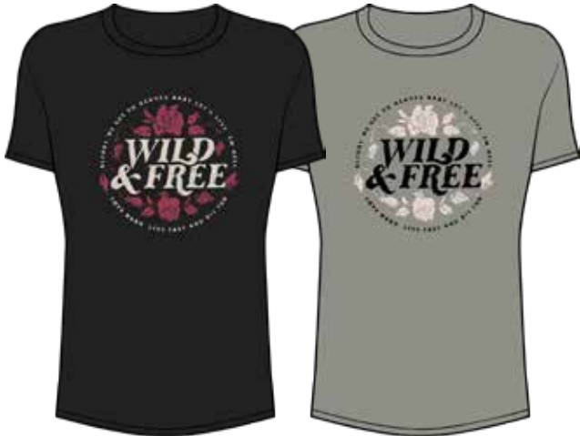
JD2938 WILD AND FREE - CREWNECK

SAGE | IVORY XS - L | 50% Cotton 50% Modal USA: w/s $16 msrp $32 CAN: w/s $20 msrp $40