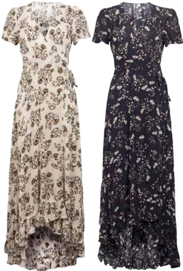
JC2909 TARYN - DRESS

IVORY | NAVY XS - L | 100% Viscose USA: w/s $27 msrp $54 CAN: w/s $32.50 msrp $65