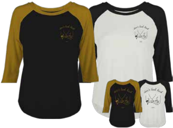
JD2943 DONT LOOK BACK - LS RAGLAN