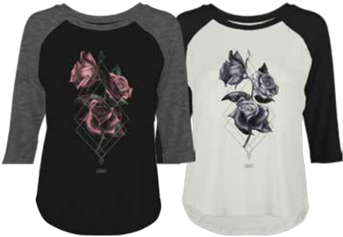
JD2946 STIPPLE ROSE - LS RAGLAN

BLACK | IVORY XS - L | 50% Cotton 50% Modal USA: w/s $16 msrp $32 CAN: w/s $20 msrp $40