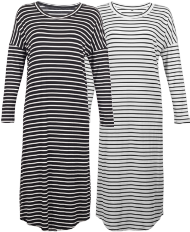
JC2911 SOFIA - DRESS

IVORY | NAVY XS - L | 100% Viscose USA: w/s $27 msrp $54 CAN: w/s $32.50 msrp $65