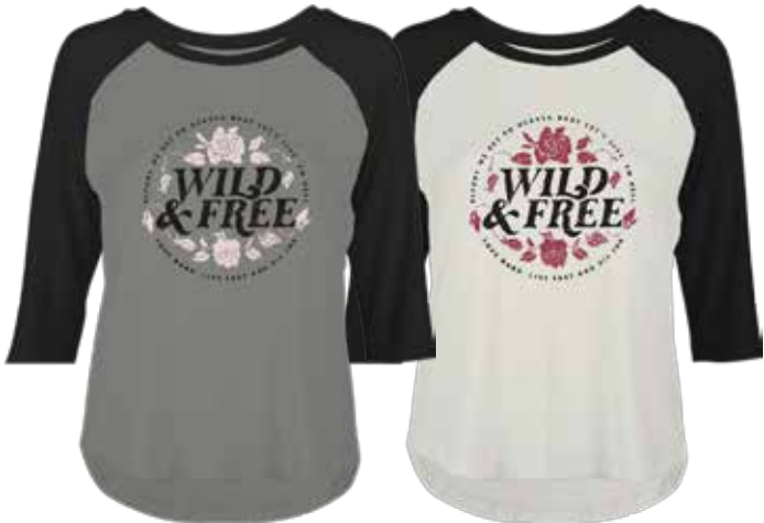
JD2937 WILD AND FREE - LS RAGLAN

BLACK | SAGE XS - L | 95% Modal 5% Spandex USA: w/s $15 msrp $30 CAN: w/s $20 msrp $40