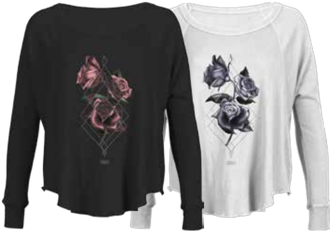
JD2945 STIPPLE ROSE - LONG SLEEVE

BLACK | IVORY XS - L | 95% Modal 5% Spandex USA: w/s $15 msrp $30 CAN: w/s $20 msrp $40