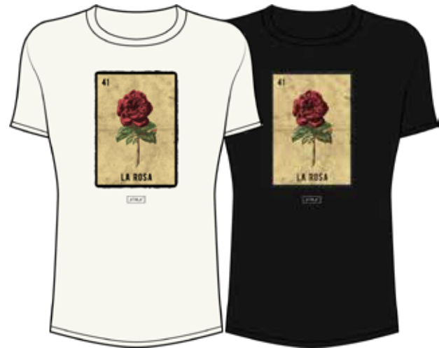
JD2864 LOTERIA CREWNECK

IVORY | BLACK XS - L | 50% Modal 50% Cotton USA: w/s $16 msrp $32 CAN: w/s $20 msrp $40