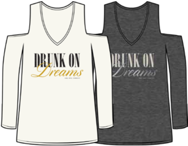
JD2859 DREAMS LS OPEN SHOULDER

IVORY | BLACK XS - L | 50% Modal 50% Cotton USA: w/s $16 msrp $32 CAN: w/s $20 msrp $40