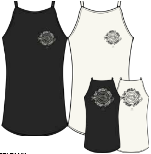
JD2853 MAFFI TANK

BLACK | IVORY XS - L | 95% Modal 5% Spandex USA: w/s $16 msrp $32 CAN: w/s $20 msrp $40