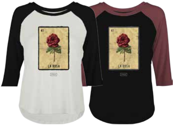
JD2862 LOTERIA RAGLAN

IVORY | BLACK XS - L | 50% Modal 50% Cotton USA: w/s $16 msrp $32 CAN: w/s $20 msrp $40