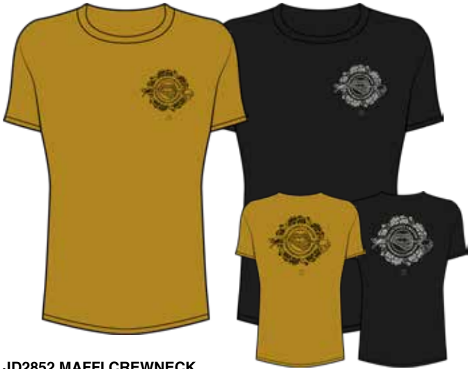
JD2852 MAFFI CREWNECK

BLACK | IVORY XS - L | 50% Modal 50% Cotton USA: w/s $16 msrp $32 CAN: w/s $20 msrp $40