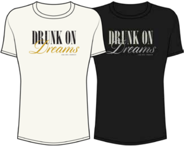
JD2860 DREAMS CREWNECK

IVORY | CHARCOAL XS - L | 95% Modal 5% Spandex USA: w/s $16 msrp $32 CAN: w/s $20 msrp $40