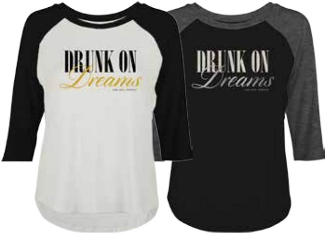
JD2858 DREAMS RAGLAN

IVORY | BLACK XS - L | 50% Modal 50% Cotton USA: w/s $16 msrp $32 CAN: w/s $20 msrp $40