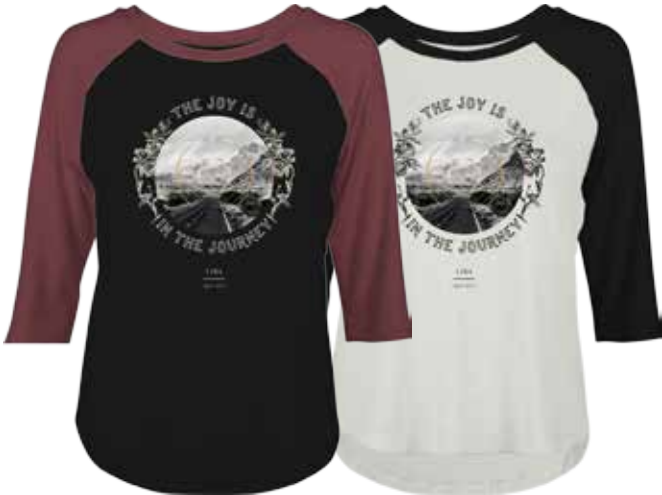
JD2854 JOURNEY RAGLAN

BLACK | IVORY XS - L | 50% Modal 50% Cotton USA: w/s $16 msrp $32 CAN: w/s $20 msrp $40