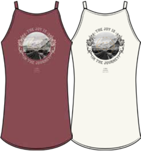
JD2857 JOURNEY TANK

BURGUNDY | IVORY XS - L | 95% Modal 5% Spandex USA: w/s $14 msrp $28 CAN: w/s $18 msrp $36