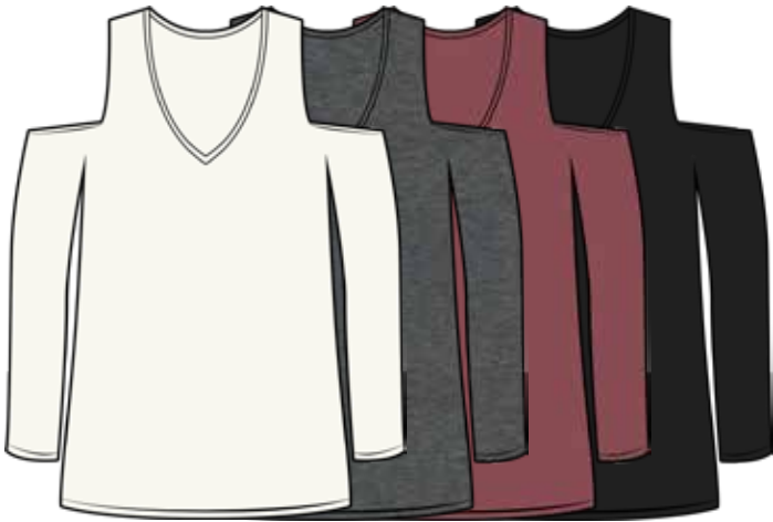
JD2867 SOLID LS

IVORY | CHARCOAL | BURGUNDY | BLACK XS - L | 50% Modal 50% Cotton USA: w/s $14 msrp $28 CAN: w/s $18 msrp $36