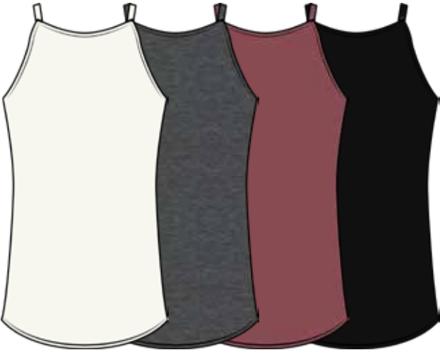
JD2869 SOLID TANK

IVORY | CHARCOAL | BURGUNDY | BLACK XS - L | 95% Modal 5% Spandex USA: w/s $1 msrp $24 CAN: w/s $15 msrp $30