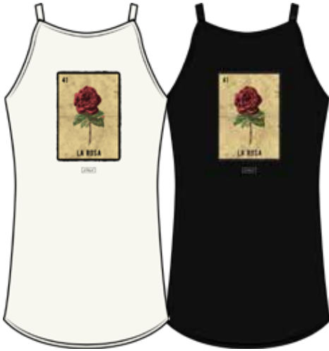
JD2865 LOTERIA TANK

IVORY | BURGUNDY XS - L | 95% Modal 5% Spandex USA: w/s $16 msrp $32 CAN: w/s $20 msrp $40