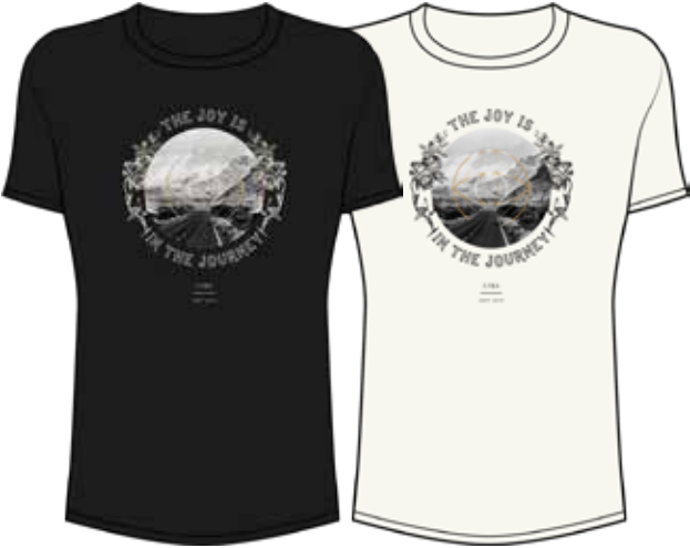
JD2856 JOURNEY CREWNECK

BLACK | IVORY XS - L | 95% Modal 5% Spandex USA: w/s $14 msrp $28 CAN: w/s $18 msrp $36