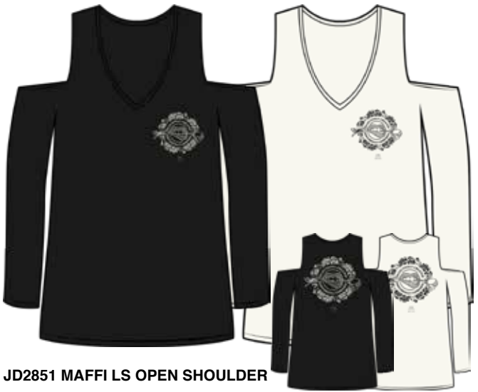
JD2851 MAFFI LS OPEN SHOULDER

MUSTARD | BLACK XS - L | 95% Modal 5% Spandex USA: w/s $14 msrp $28 CAN: w/s $18 msrp $36