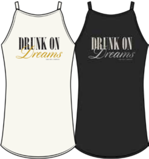
JD2861 DREAMS TANK

IVORY | BLACK XS - L | 95% Modal 5% Spandex USA: w/s $14 msrp $28 CAN: w/s $18 msrp $36