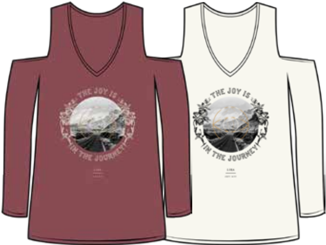
JD2855 JOURNEY LS OPEN SHOULDER

BURGUNDY | IVORY XS - L | 95% Modal 5% Spandex USA: w/s $16 msrp $32 CAN: w/s $20 msrp $40