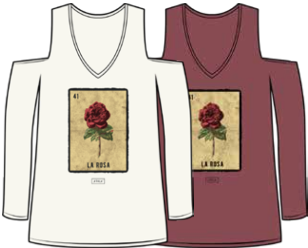
JD2863 LOTERIA LS OPEN SHOULDER

IVORY | BLACK XS - L | 95% Modal 5% Spandex USA: w/s $14 msrp $28 CAN: w/s $18 msrp $36