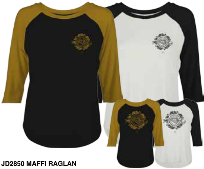
JD2850 MAFFI RAGLAN

BLACK | IVORY XS - L | 50% Modal 50% Cotton USA: w/s $16 msrp $32 CAN: w/s $20 msrp $40