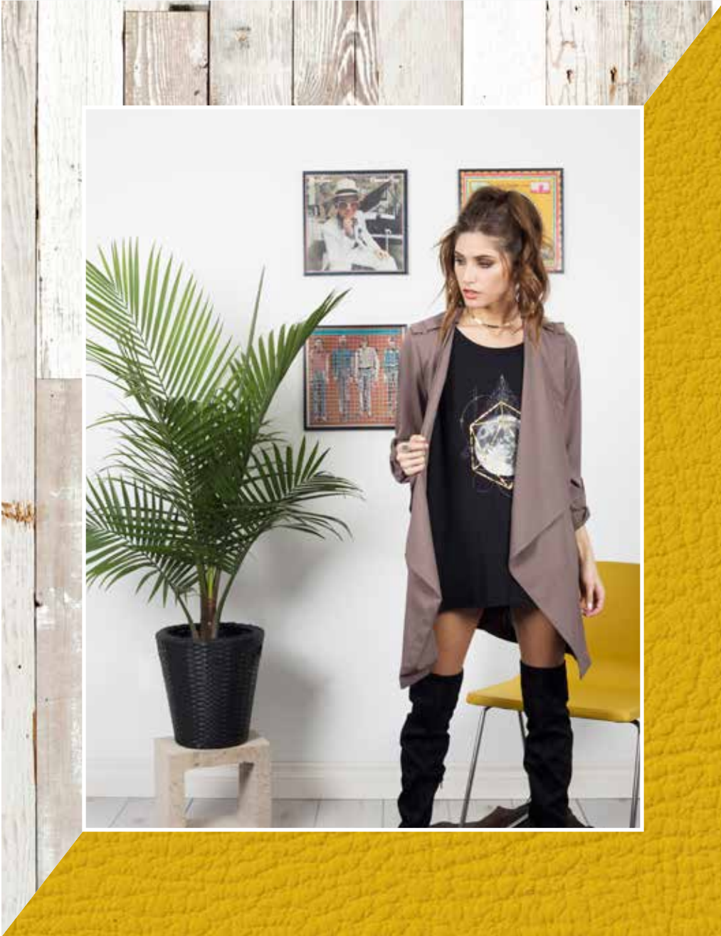
Wonderwall Duster Charcoal Geo Moon Tunic Black