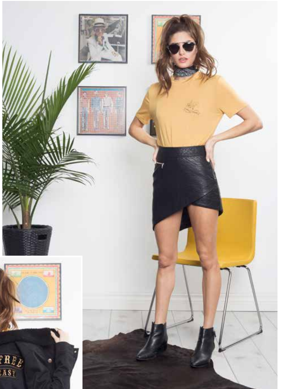
Cool Kids Tee Mustard Juniper Skirt Black