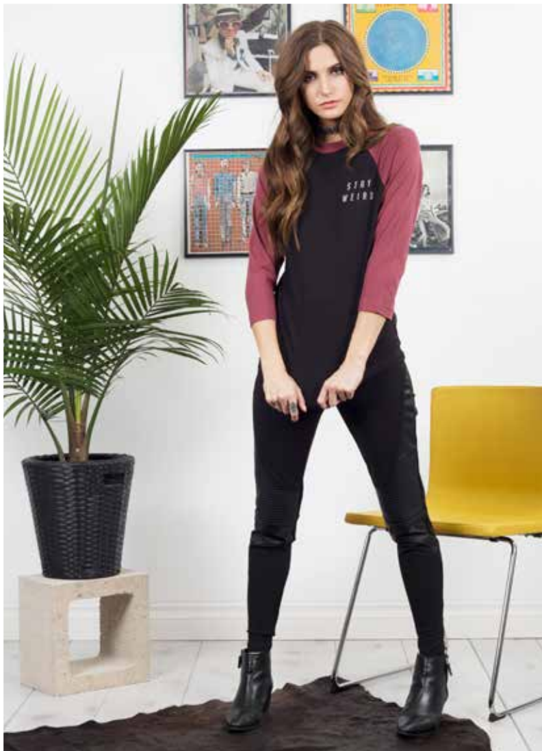
Stay Weird Raglan Black Full Throttle Legging Black