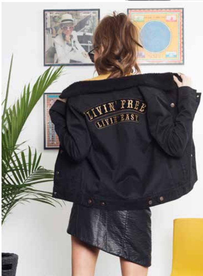
Livin' Free Jacket Black Juniper Skirt Black