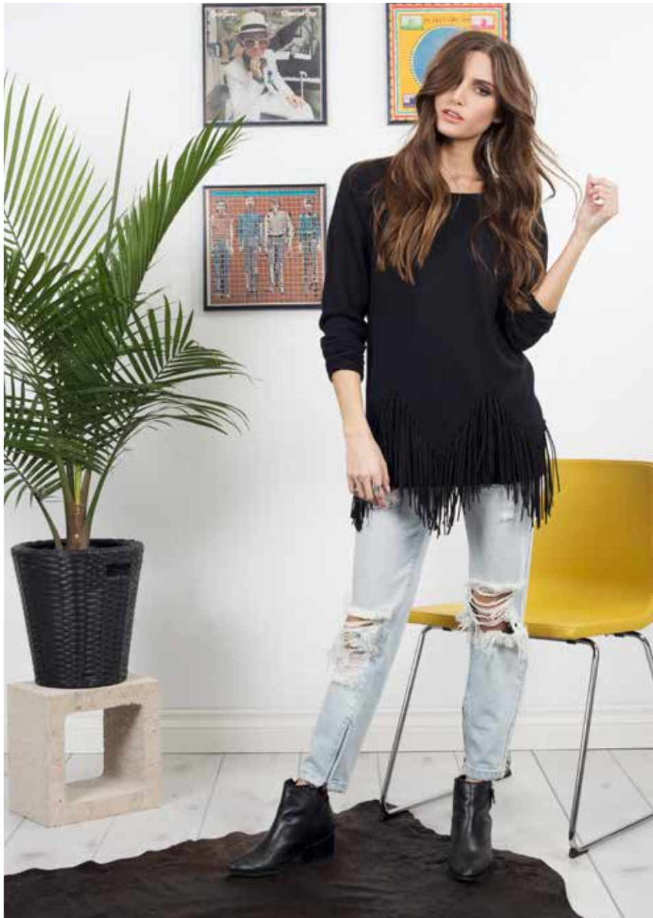
Gwen Sweater Black Keepsake Pant Lt.Blue