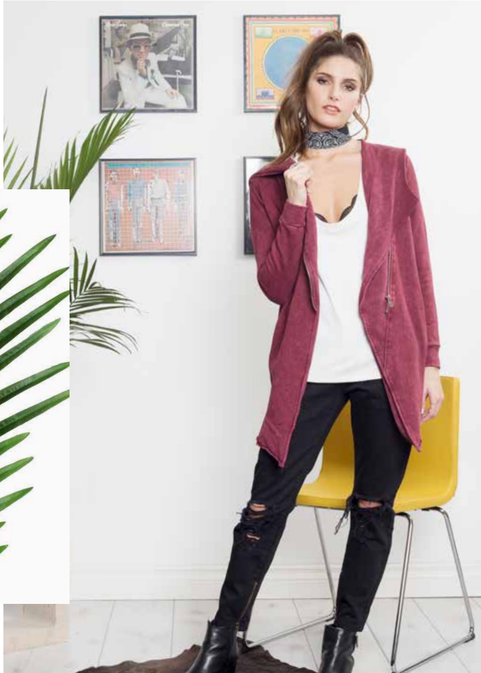
Heated Fleece Burg Terri Thermal Ivory Keepsake Pant Black