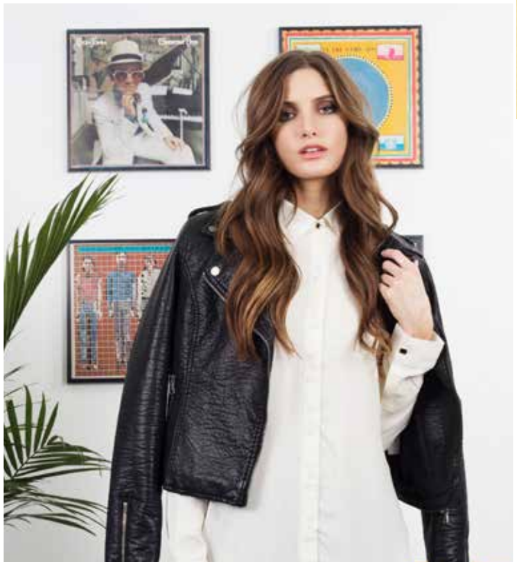
Afterhours Jacket Slipaway Tunic