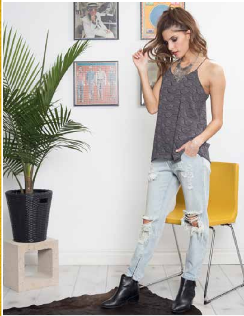
Dallas Top Black Keepsake Pant Lt.Blue