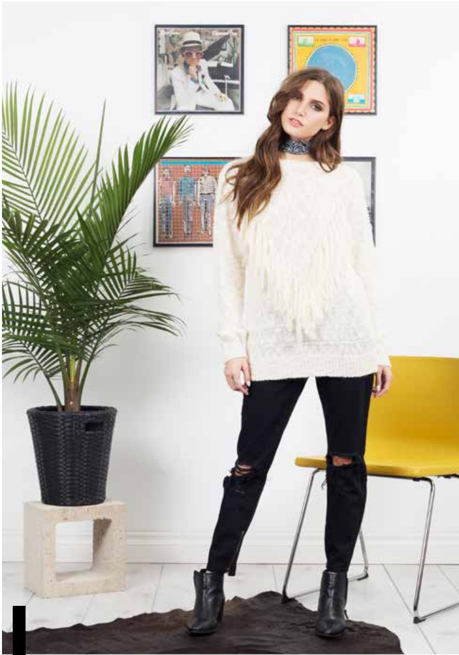
Rosemary Sweater Ivory Keepsake Pant Black