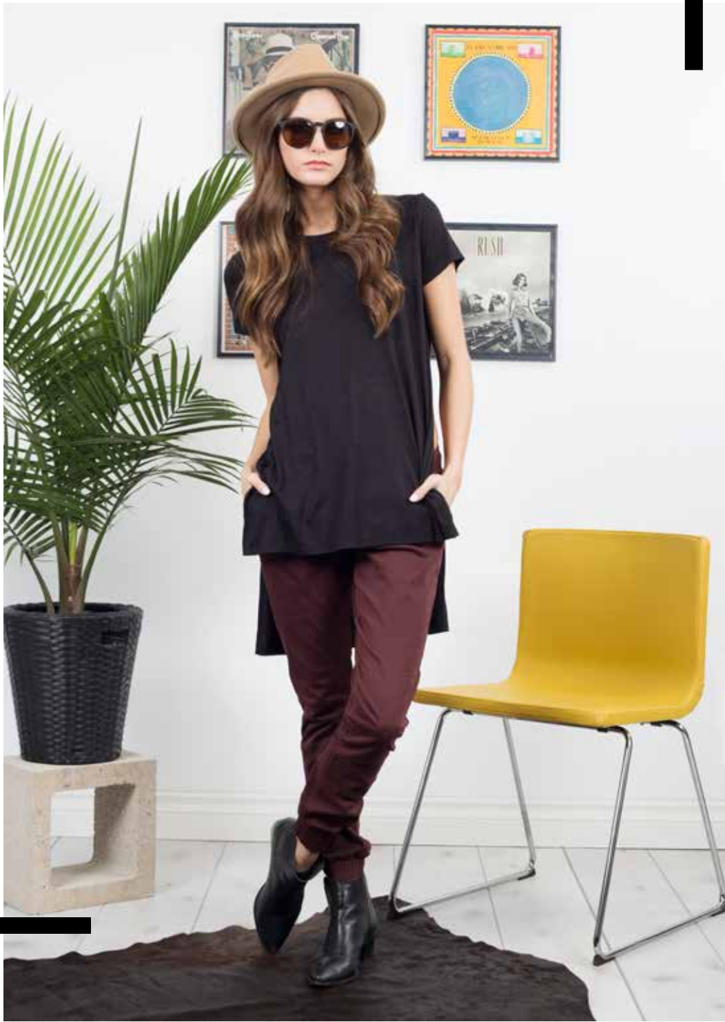
Atlas Tunic Black Legends Jogger Burg