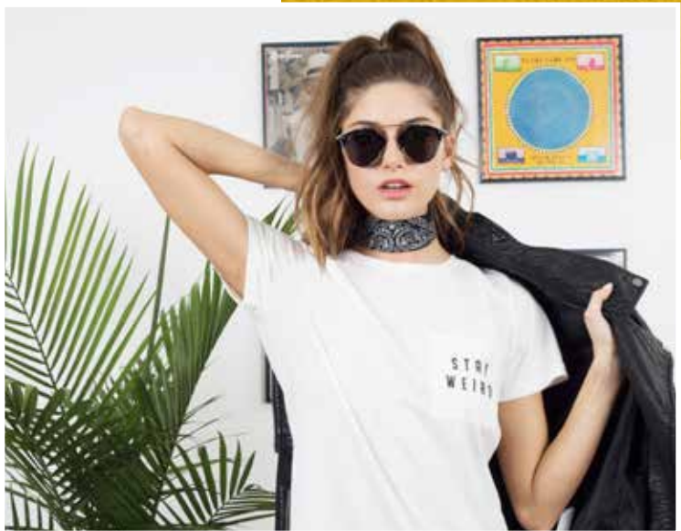
Afterhours Jacket Black Stay Weird Tunic